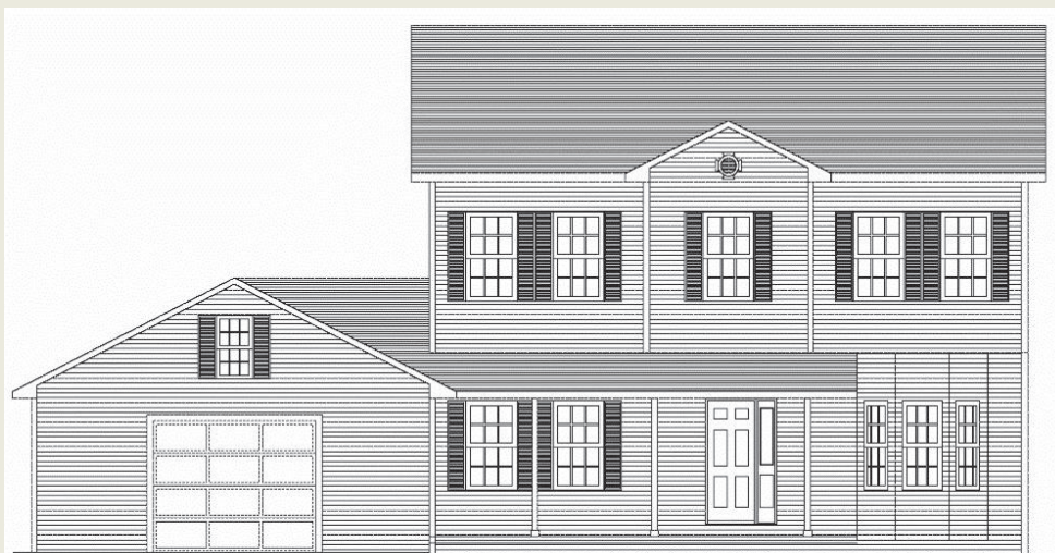
Figure 1. Traditional style elevation blueprint drawing

There are two types of blueprint drawings that are used in the construction industry that correlate to the theoretical framework of the dissertation. First, an architect must create an elevation drawing to display the exterior of the home. This drawing offers an outside view of the style and structure, as shown in Figure 1.